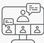
Cancer Ideas Labs 2021-2022