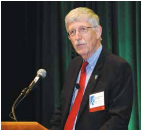
Francis Collins, MD, PhD, Director of the National Institutes of Health

The 26th Annual Fanconi Anemia Research Fund Scientific Symposium, held last September in Bethesda, Md., was attended by 211 scientists, clinicians, Fund board members, and family representatives from 17 countries, including Egypt, South Africa, and the Czech Republic. Nine sessions over four days commenced with FA 101, an introduction to the clinical and biological aspects of FA, popular with both veterans and newcomers alike. Researchers presented 39 abstracts on subjects including Head and Neck Squamous Cell Carcinoma; Malignant Transformation; Aldehydes and Bone Marrow Failure; Experimental Hematology; Expanding FA Clinical Phenotype; FA Proteins: Structure and Function; FA Therapeutics: Past, Present, and Future; and Mutation to Phenotype. An additional 68 abstracts