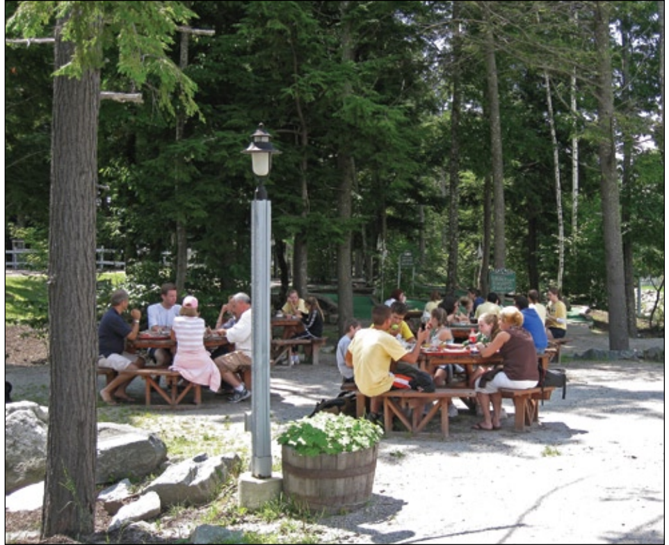
FA families picnicking at Camp