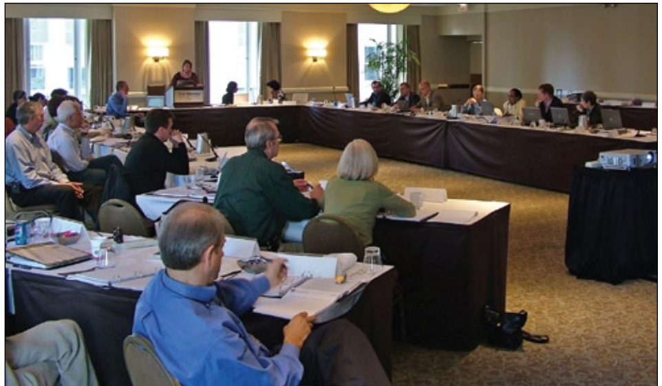
Participants at the Consensus Conference

Your editors know of no study or of any anecdotal cases of FA patients using imiquimod or any other topical therapy for vulvar neoplasia. We have no data on how FA patients would respond to this medication. Laser surgery (for more superficial lesions) and surgical excision (to remove a deeper neoplasia) are commonly used for this complication. Recurrences can occur, because surgery may not eliminate all precancerous cells and does not eliminate HPV, which causes many of these cancers. ♦