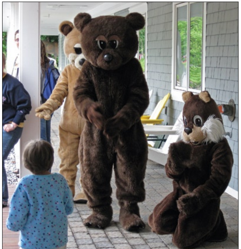
A furry welcome to Camp