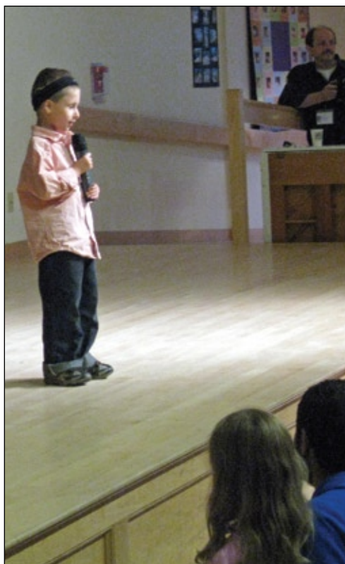
Talent contest at Camp Sunshine

The Fanconi Anemia Research Fund continues to encourage and fund research into Head and Neck Squamous Cell Carcinoma and in 2006 held a workshop on this topic in Bethesda, Maryland. Science is continuously changing to improve outcomes, but currently a patient's most potent tools are rigorous screening and prevention. ♦