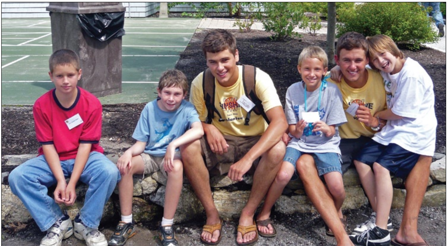
Camp Sunshine volunteers and happy campers