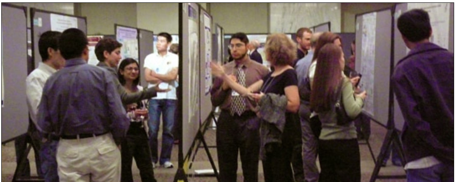
Researchers discuss posters at the Symposium.