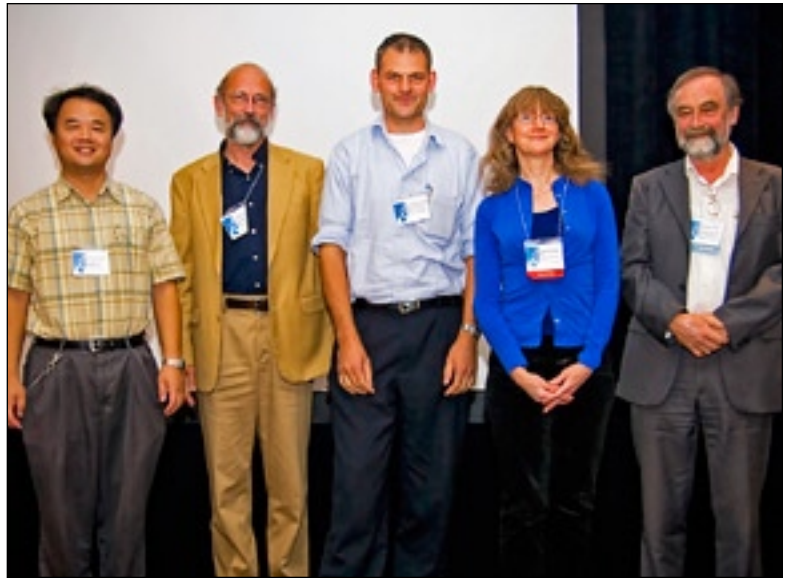
Authors of one of the Nature Genetics articles on FANCN

Biallelic Mutations in PALB2 Cause Fanconi Anemia Subtype FA-N and Predispose to Childhood Cancer, Nature Genetics: