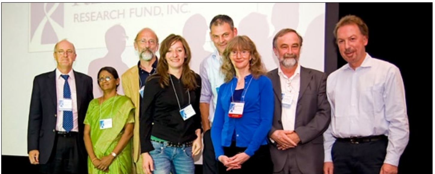
Authors of Cellular Oncology article on FANCI