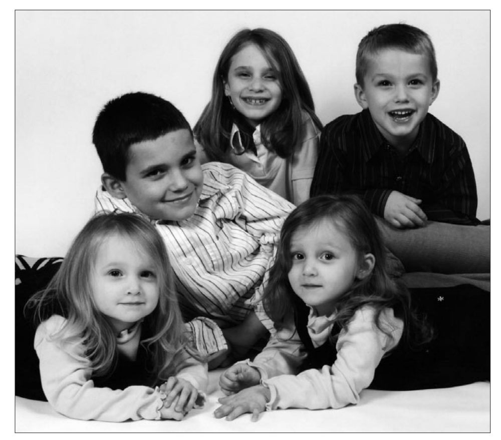
The Flynn Family

I don't remember the total amount raised from that letter but, as a result, we still have people who donate annually to FARF from what started as one letter. Some of the companies they work for match their donations.