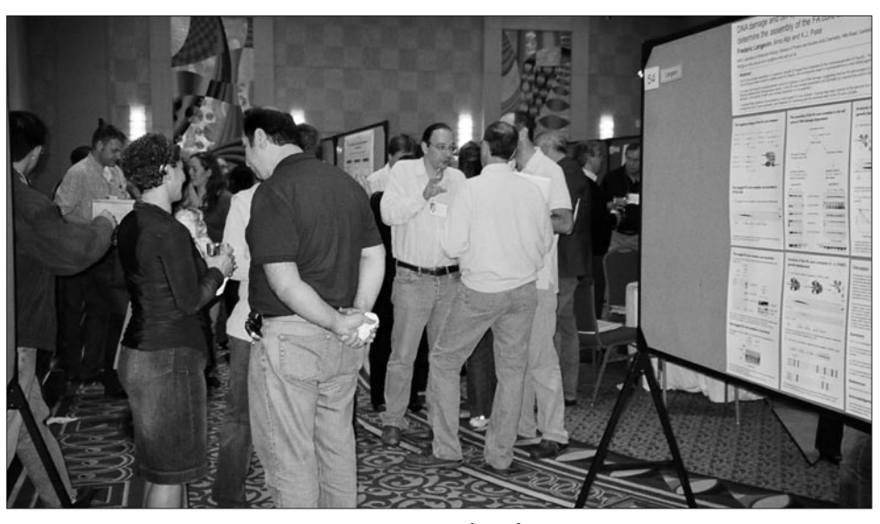
Researchers discuss poster presentations at Symposium