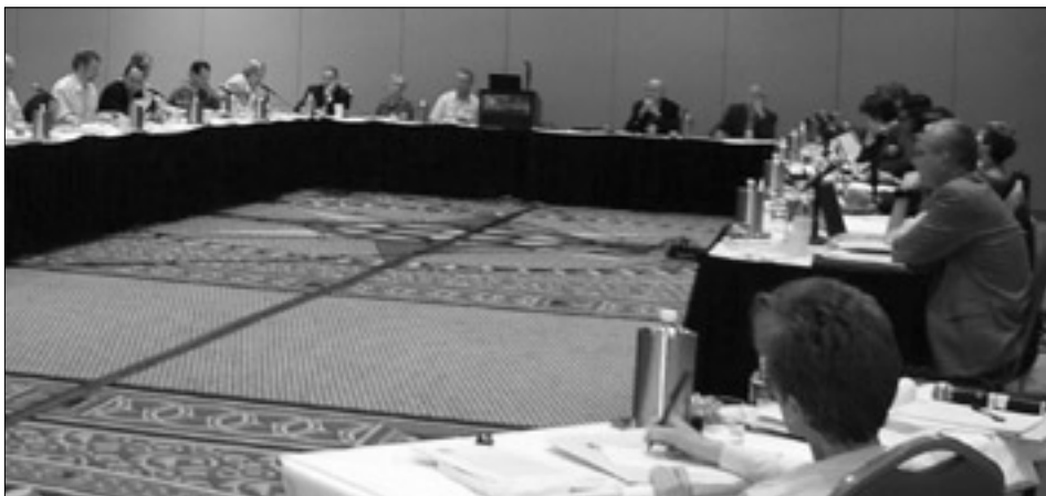
Participants in the Squamous Cell Carcinoma Conference.