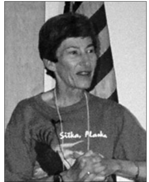
Blanche Alter, MD, MPH

Blanche Alter, MD, MPH, National Cancer Institute, gave a very helpful overview of FA to families at our July Family Meeting. She informed us that FA is the most frequent of the rare inherited bone marrow failure syndromes, with more than 1,300 cases reported in the literature. FA is mostly inherited as an autosomal recessive disease (each parent is a carrier, with one normal and one abnormal FA gene; the FA patient receives one abnormal FA gene from each parent), although one rare type, FA-B, is X-linked and found only in boys. The average age at diagnosis is 9, but occasionally adults have been first identified in their 50's. Birth defects are reported in around 75% of known patients,