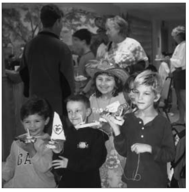
Showing off their Wish Boats.