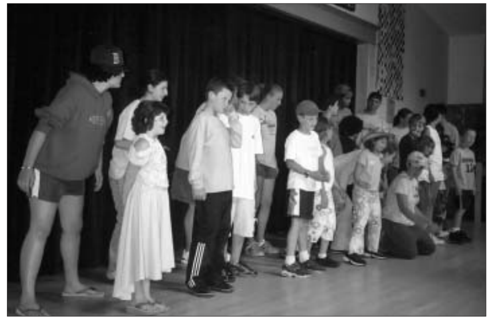
Performing in the Talent Show.

Families sometimes felt overwhelmed with the wealth of data,