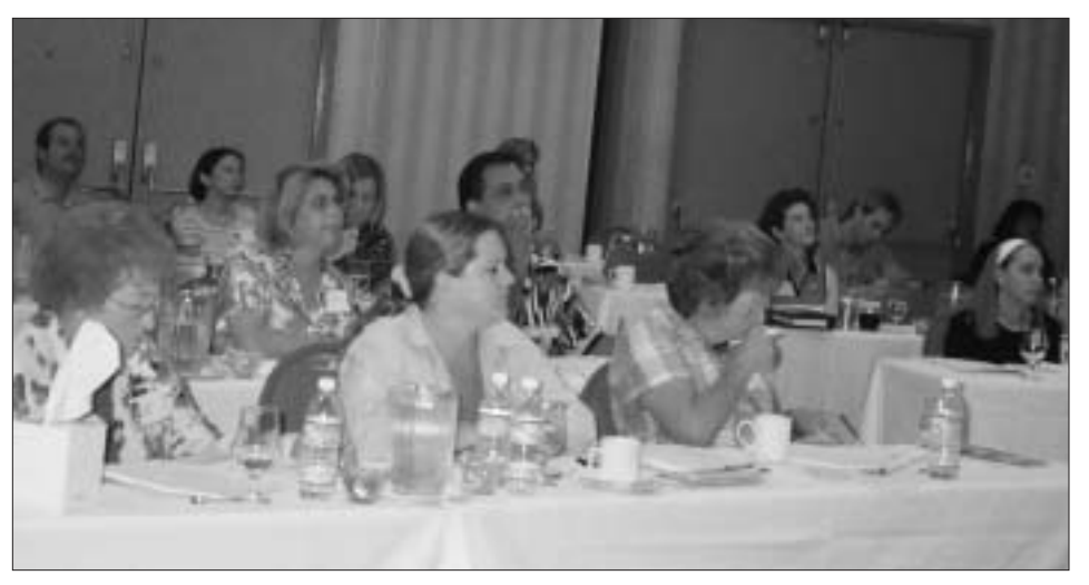
FA families and patients listen to medical presentations at Regional Meeting.