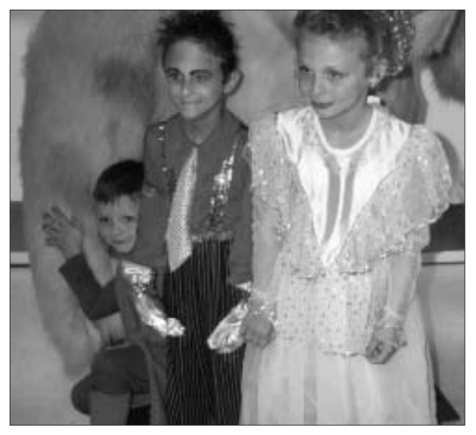
The Frock kids dressed for the Masquerade Ball.