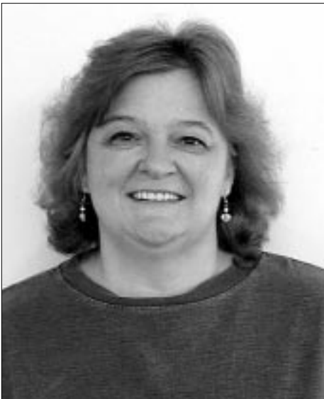
Image Masters Printers