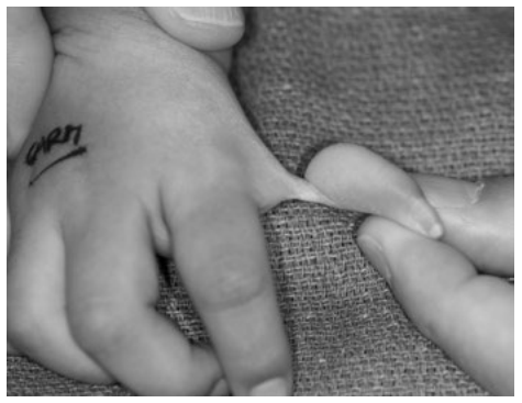
Figure 2 (see Figure legend on next page)