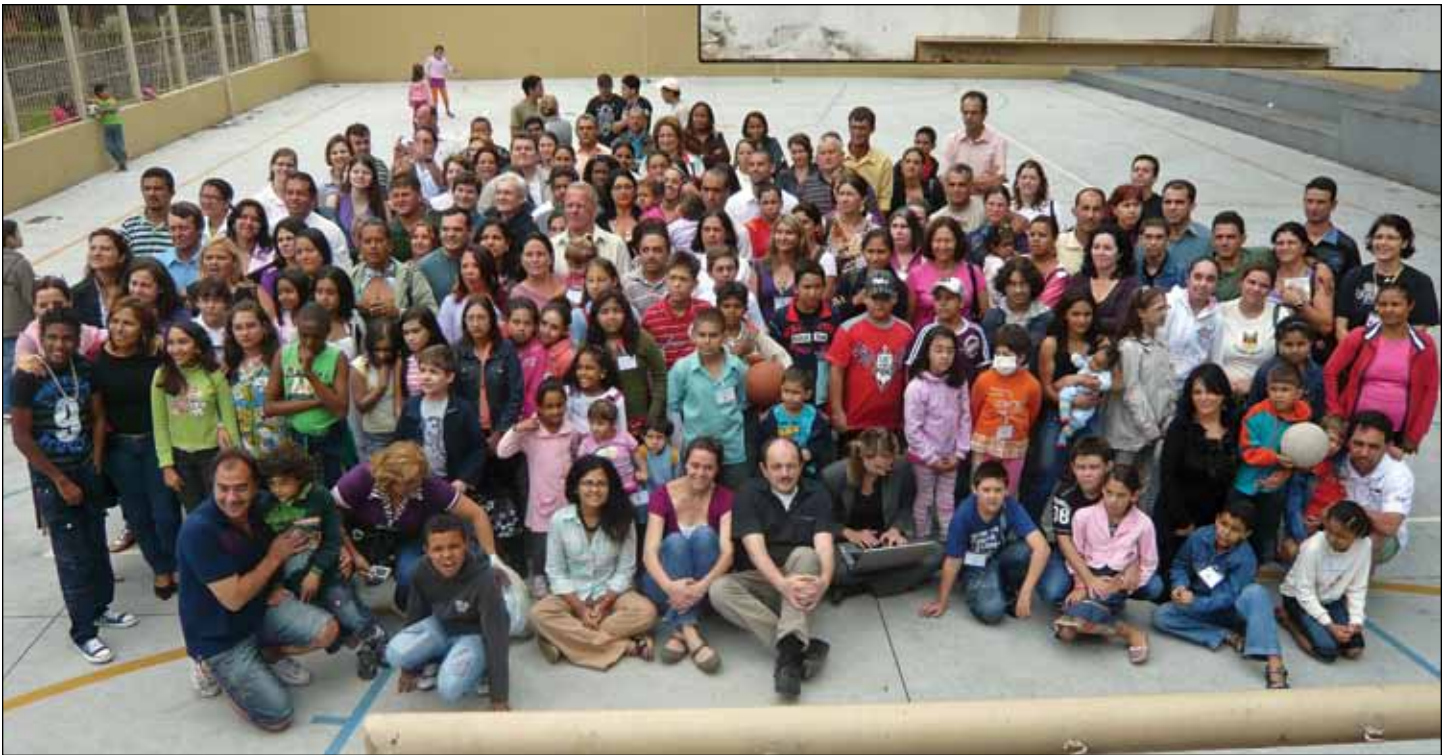
Participants at the 2009 Brazil Family Meeting