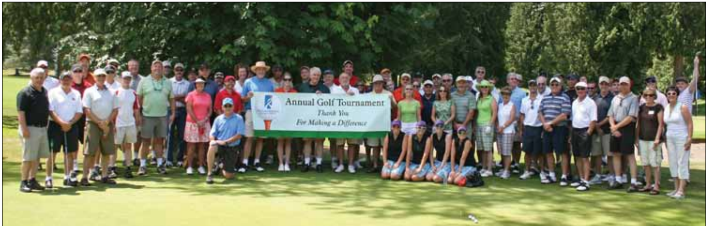
Participants at the 6th Annual Golf Scramble