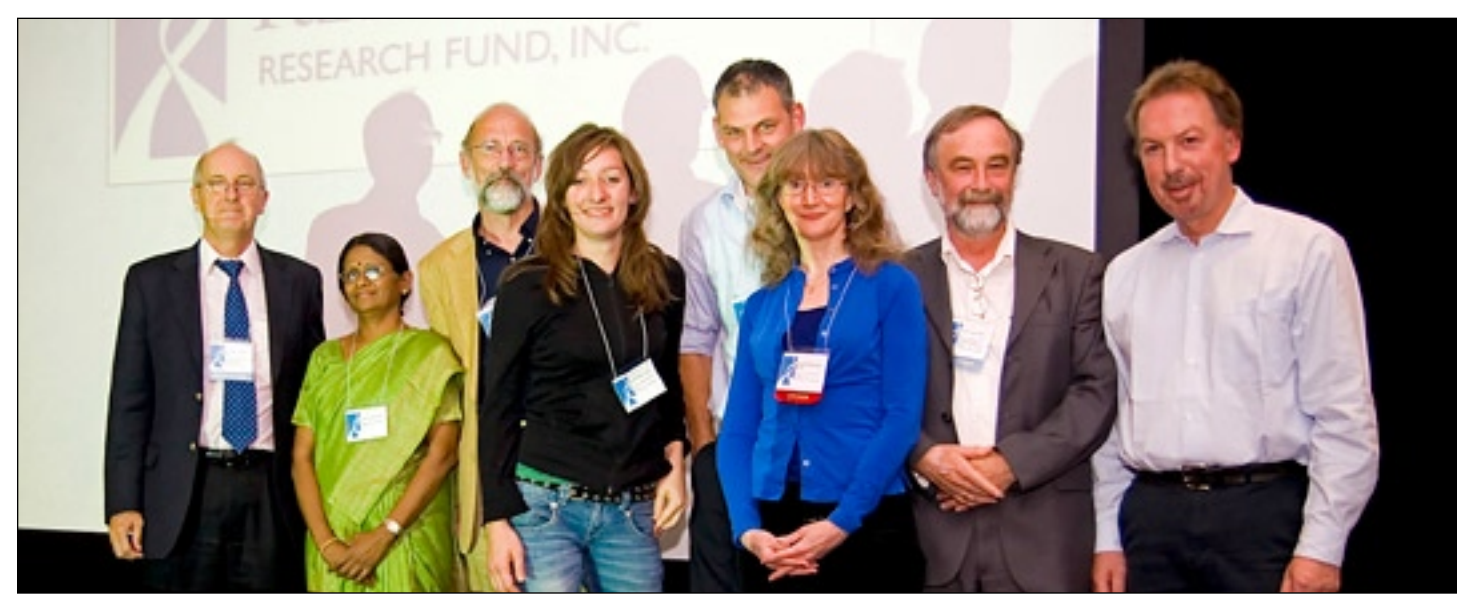
Authors of Cellular Oncology article on FANCI