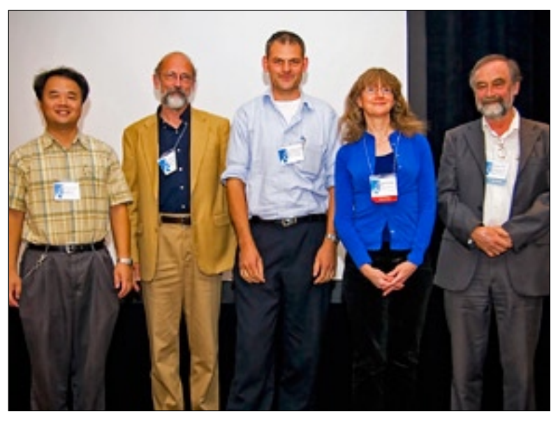
Authors of one of the Nature Genetics articles on FANCN

Biallelic Mutations in PALB2 Cause Fanconi Anemia Subtype FA-N and Predispose to Childhood Cancer, Nature Genetics: