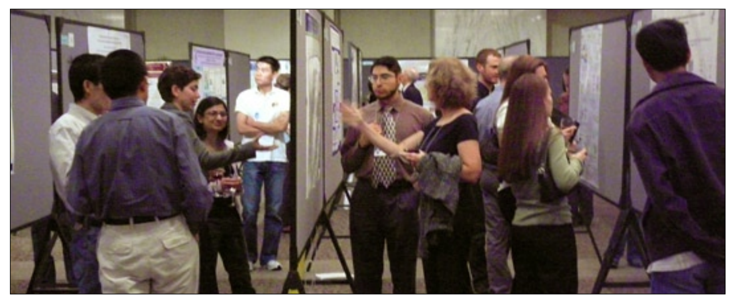
Researchers discuss posters at the Symposium.