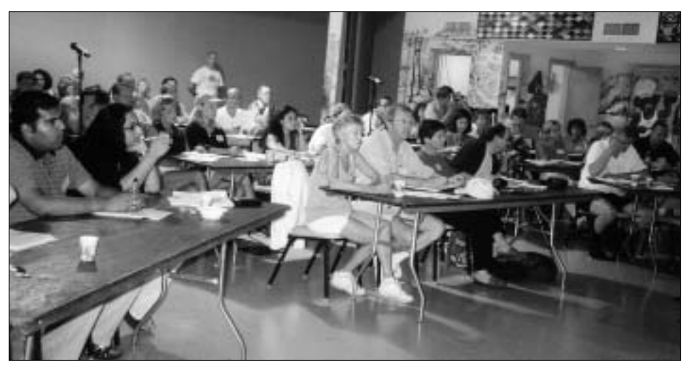
FA parents listen carefully to presentation of FA treatment and research findings.

Head and neck cancer screening includes an examination of the oral pharynx, the throat, and the region down to the vocal cords (this requires insertion of a flexible scope into a nostril and down the throat). Comprehensive oral screening should be done annually, starting at age 10 in untransplanted patients, and within the year after transplant at any age. Monitoring for gynecologic cancer should begin at age 16 or earlier. Skin examination should be done as part of an annual physical. Pain, sores, or lesions that persist for more than a brief time should be brought to the attention of a physician. Patients on androgens (or who have previously received androgens) should have an annual ultrasound of the liver, as well as liver enzyme tests 3-4 times per year.