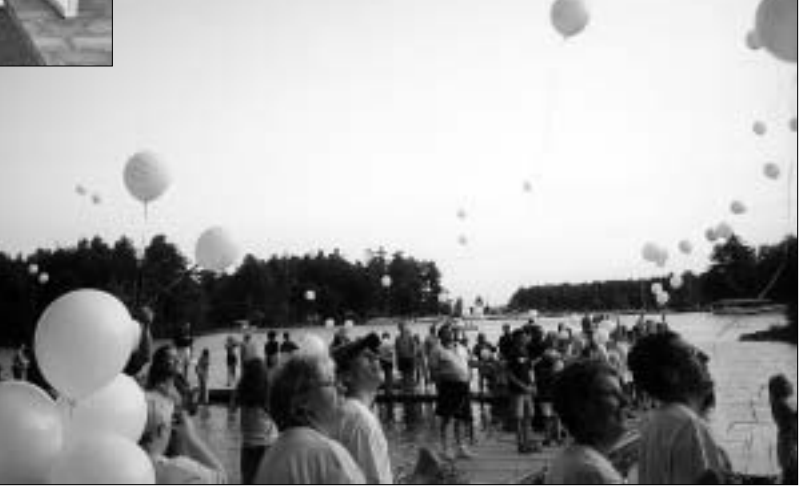
Friends and family release memorial balloons on the shore of Sebago Lake in honor of deceased loved ones