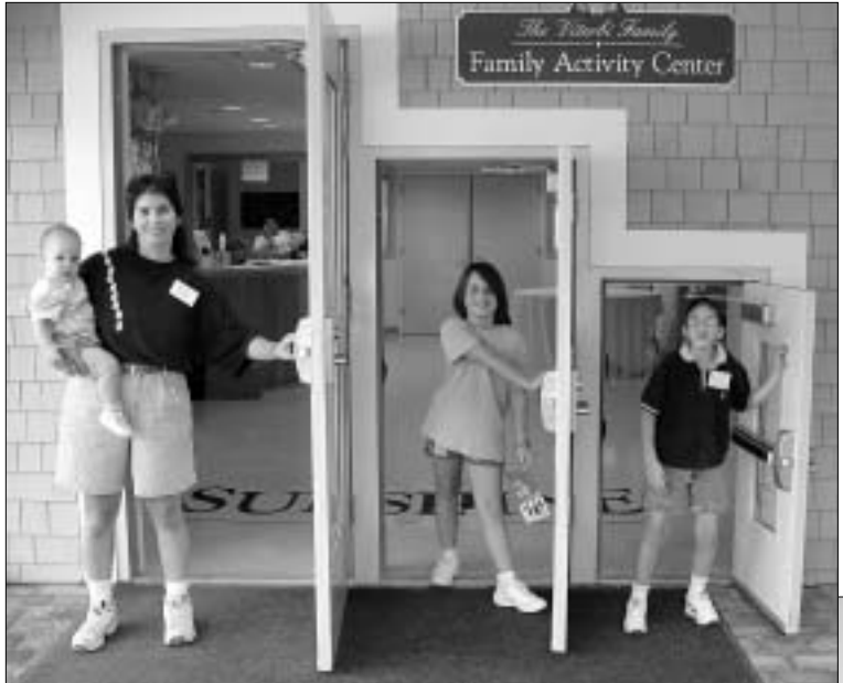
Campers of all ages and sizes are welcomed to Camp Sunshine