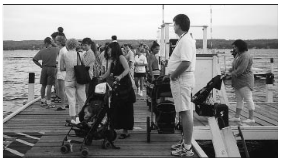
Families gather on the docks for the Memorial Balloon Release.