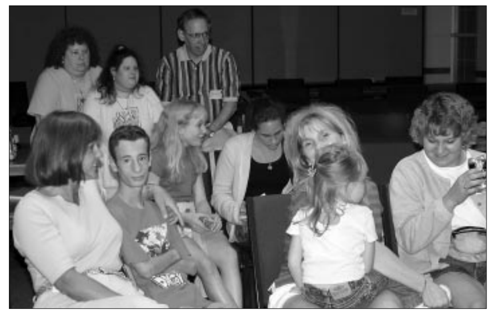
Families relaxing at Karaoke night!