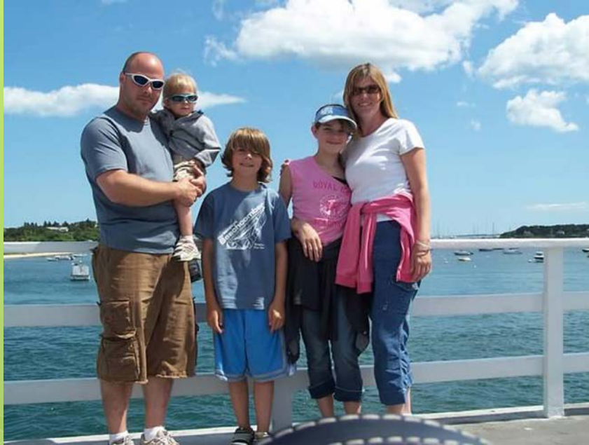
Cape Cod, 2006