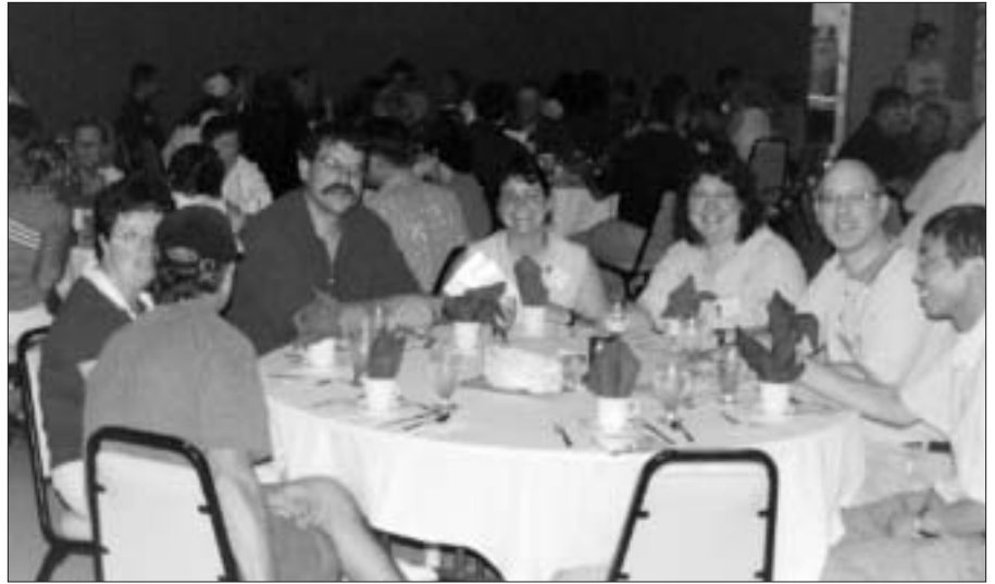
FA parents enjoying banquet dinner

Parents this year heard a wonderful panel presentation by five FA teens who have attended Camp together for years. These remarkable and articulate teens assured their parents that they did not blame them for their FA. Most had come to the conclusion that having FA has been a positive experience for them, even a “gift.” The wisdom and strength of these teens put the final touches on a wonderful Family Meeting! ♦