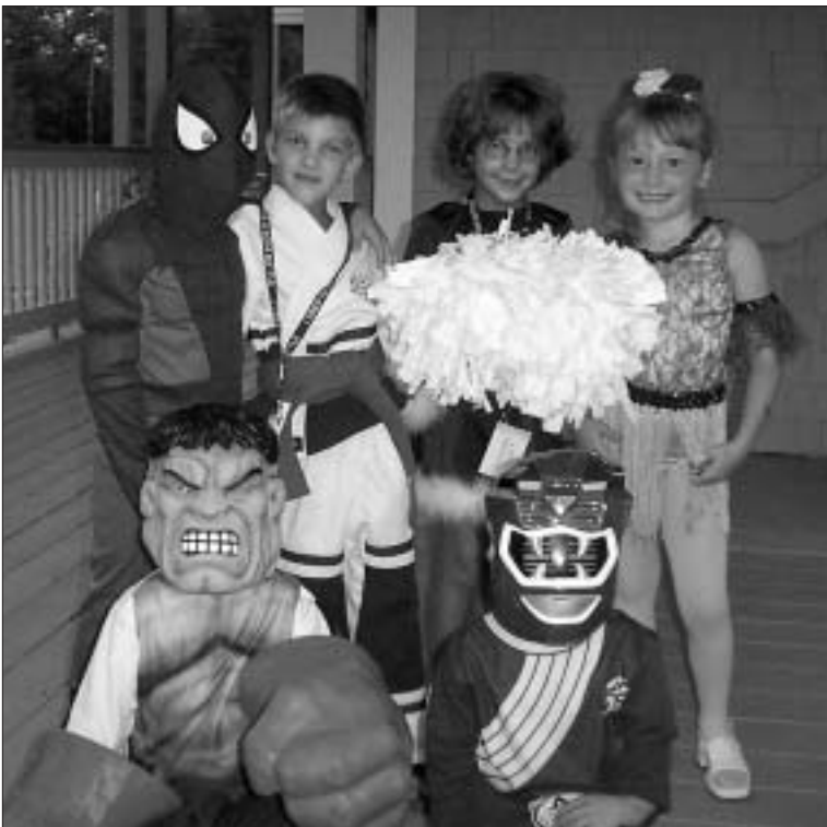
Kids dressed up for Masquerade Ball