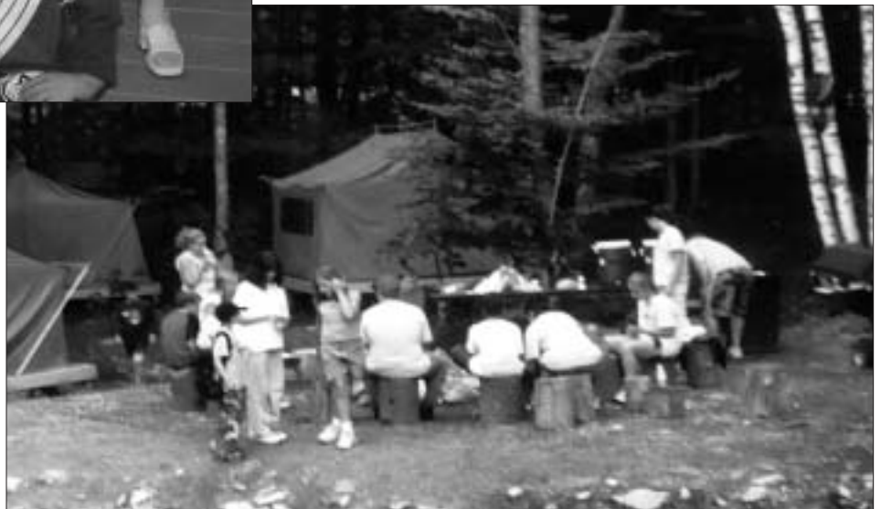
Camping out at Camp Sunshine