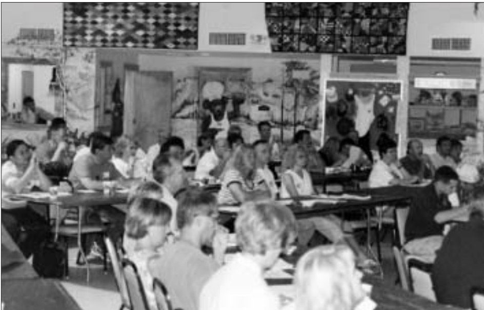
FA families listen to medical presentations.

In large part due to the growing recognition by FA parents that FA does not stop at the conclusion of a successful transplant, this year saw the return of four children who have survived transplants in the last year at three separate hospitals. To everyone's great delight, all are doing well! Seeing kids who looked pretty sick last year come through the welcoming